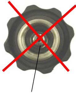
Black nipple tip o-ring, P/N 336-190-437 10 pack